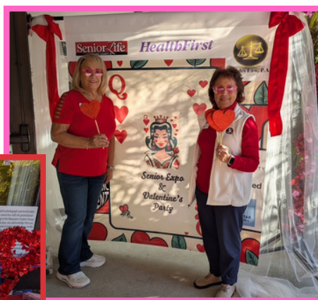
Club volunteers at the Senior Expo at the Zoo.